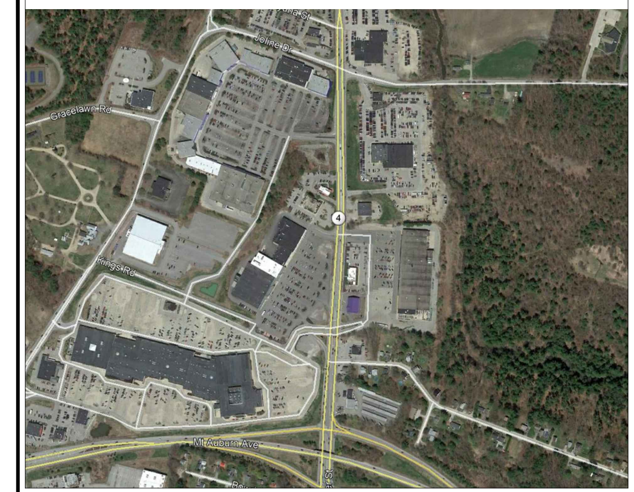
AERIAL SCALE: NTS